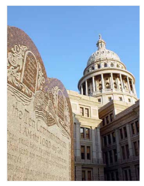
A statue of the Ten Commandments outside the Texas State Capitol, signifying the importance of the Abrahamic faiths to the American political project.

Both Moses Sexias and George Washington speak in biblical language about the meaning of America. Was America founded as a religious nation? Is a nation that affirms every person's "liberty of conscience" on matters of religious identity the same as a nation that believes it is called by G-d to create a "city upon a hill"? What is the relationship between a free society and a holy community? Can America hold together without a shared belief in a Creator and without a shared biblical language? While men of different faiths, what gave Sexias and Washington a shared faith in America?