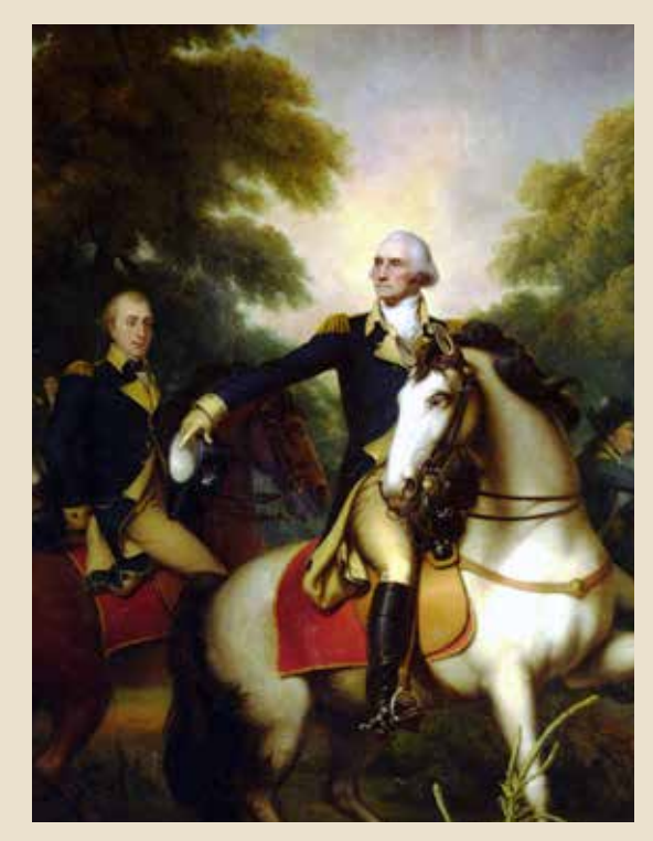
George Washinton depicted on his horse.

On July 12, 1788, the Constitution was ratified by nine out of the 13 states. George