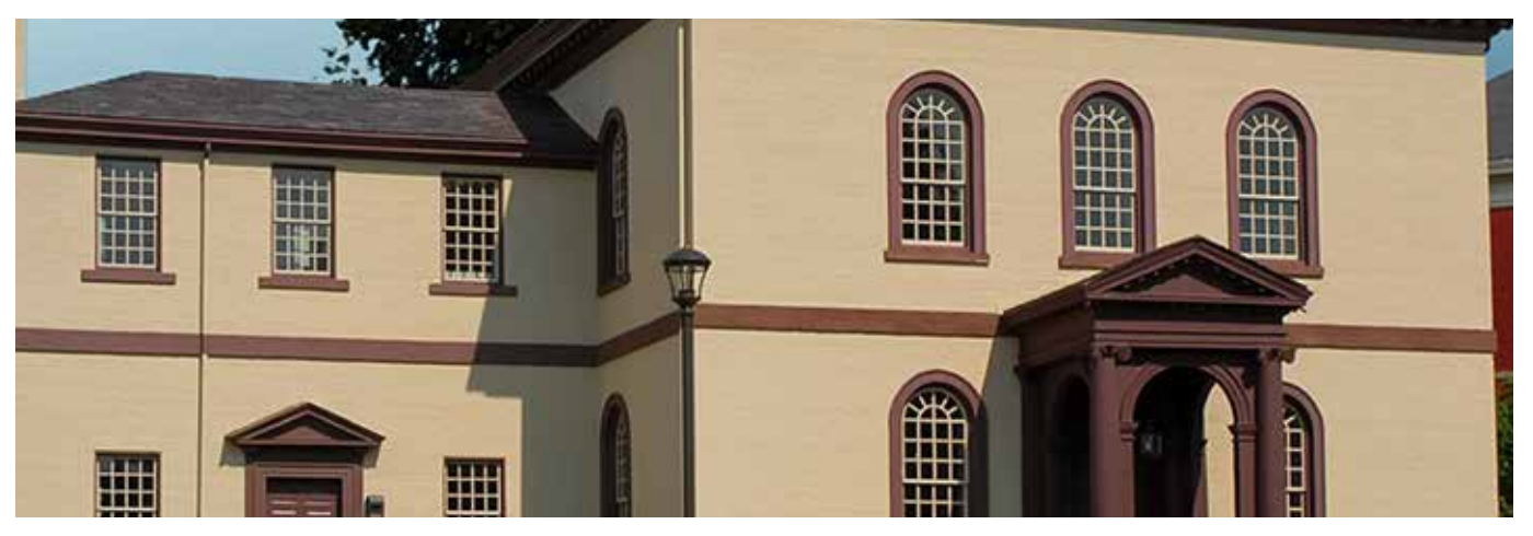
Touro Synagogue, Newport, RI