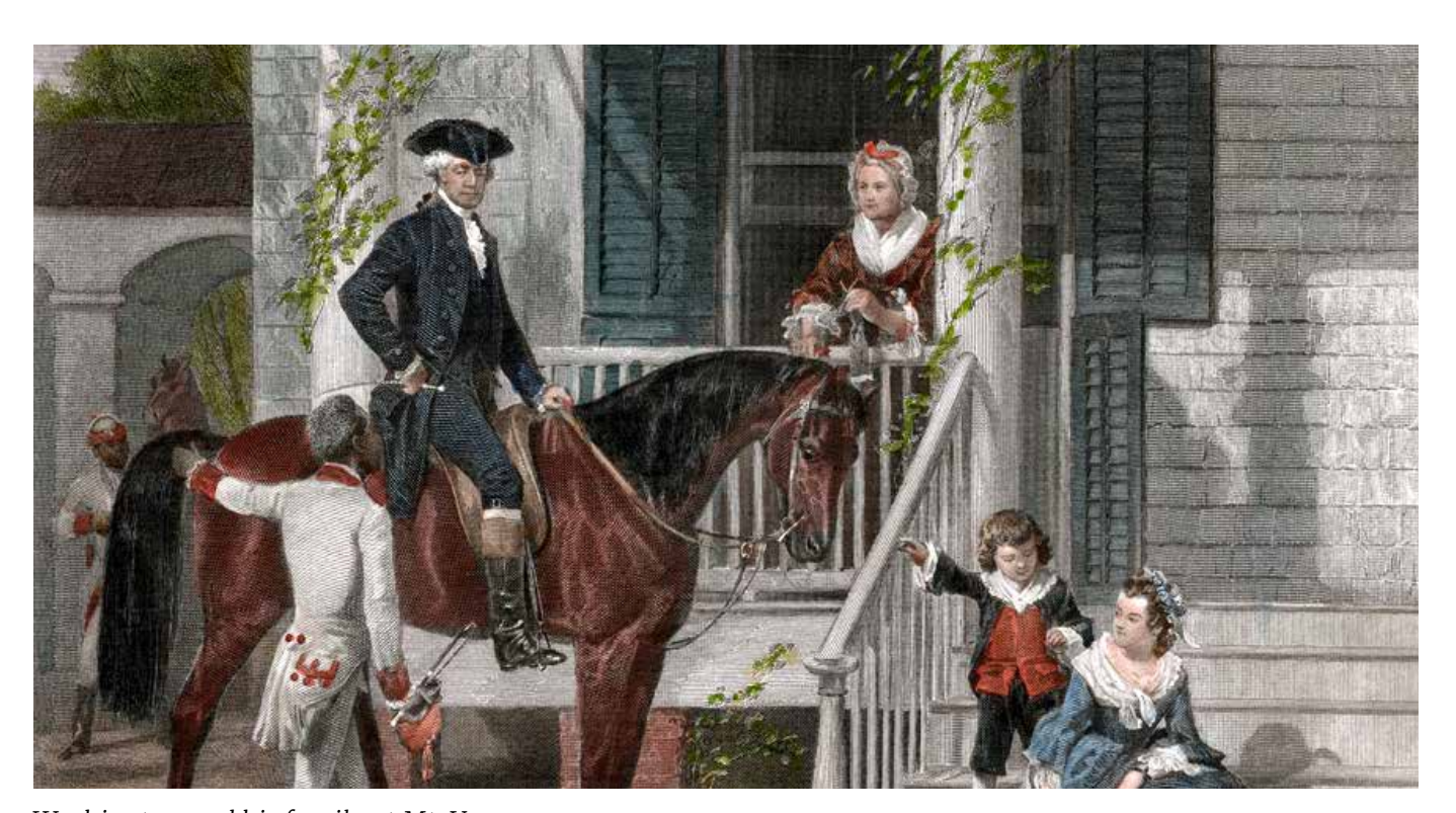
Washington and his family at Mt. Vernon

2. Consider all the lines leading up to the term "vine and fig tree." What do you make of Micah's prophecy that "many nations" will seek out the "mountain of the LORD...the temple of the G-d of Jacob"? And that these varied and far-flung nations will then "beat their swords into plowshares and their spears into pruning hooks"? In what way might this message have resonated with Washington after the war?