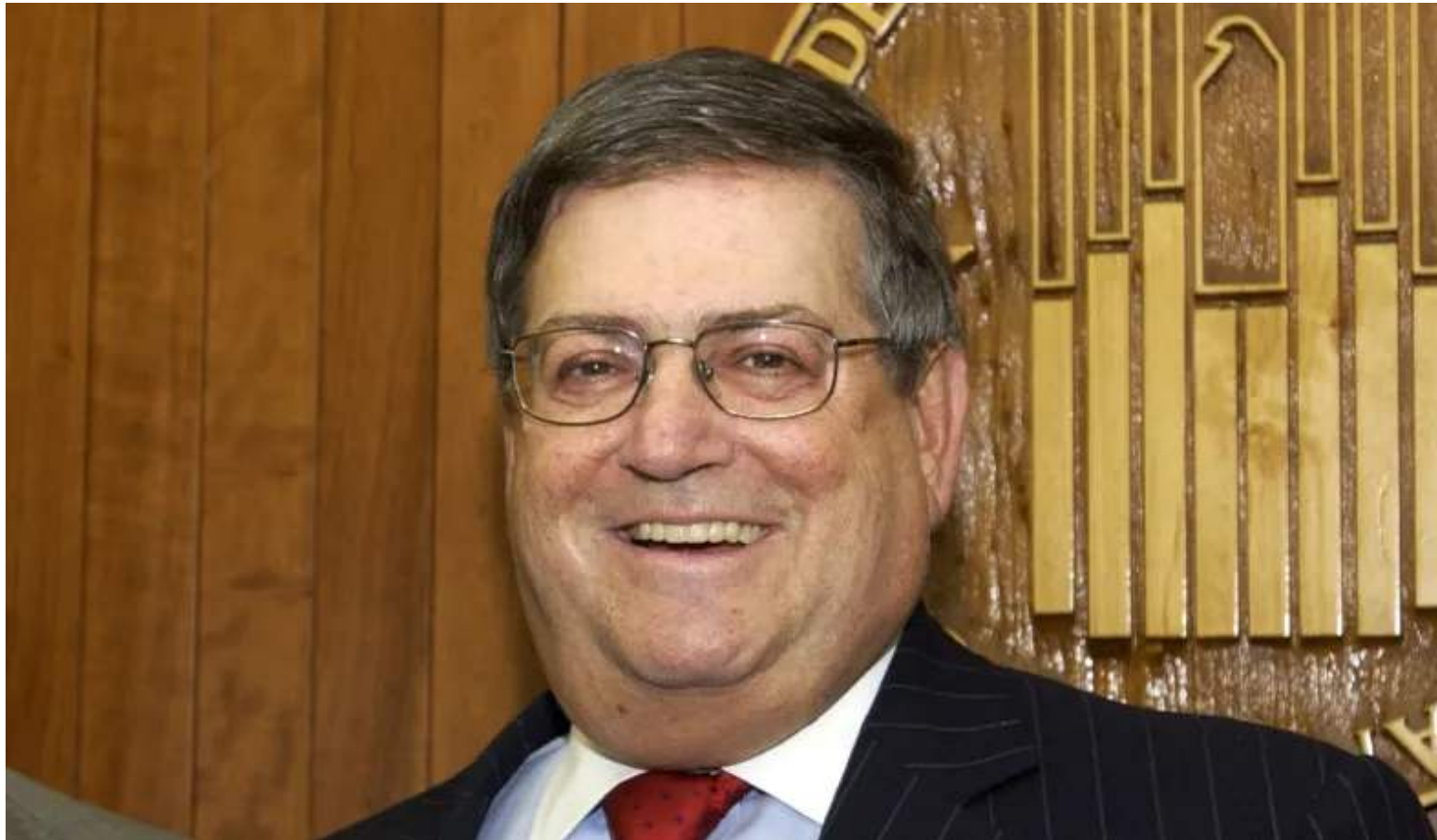
Ken Duberstein, former White House Chief of Staff for President Ronald Reagan