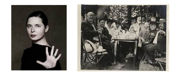
CBT is proud to co-sponsor two outstanding films