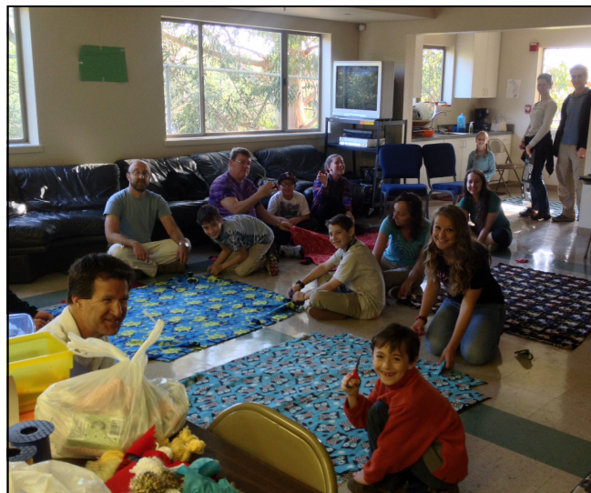
Making no - sew blankets for families at Shelter Inc.