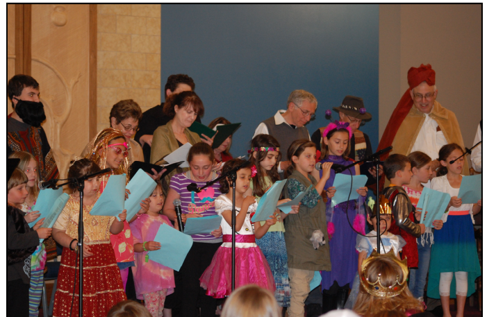
The cast of “The Megillah According to the Beatles!”