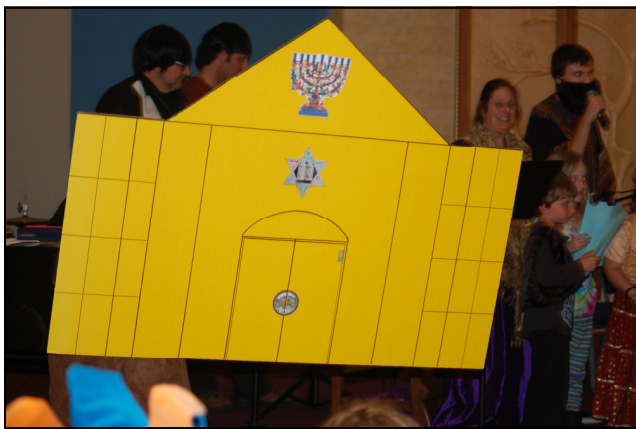
"We all pray in a yellow synagogue, a yellow synagogue, a yellow synagogue...."

For more information about these programs or other events at Midrasha, visit our website at www.ccmidrasha.com or call us at 925/944-4701.