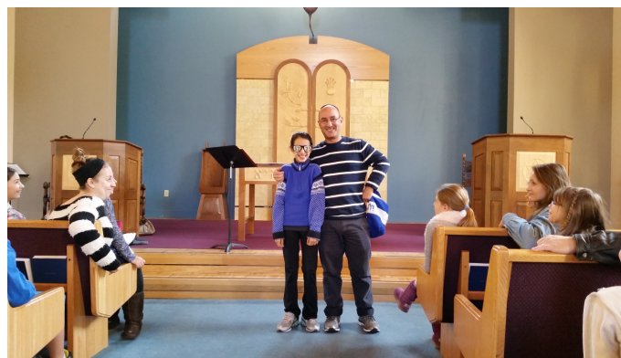
Welcoming a new student to school!