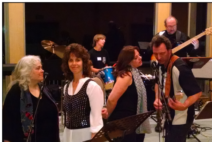
Blues and Schmooze's fantastic entertainment!

Supporting the Gift Shop supports Your synagogue!