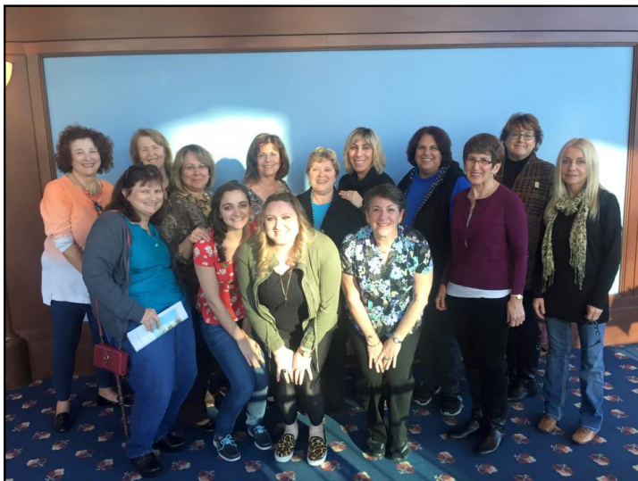
Books Sisters at "The Book Club" at Leshner