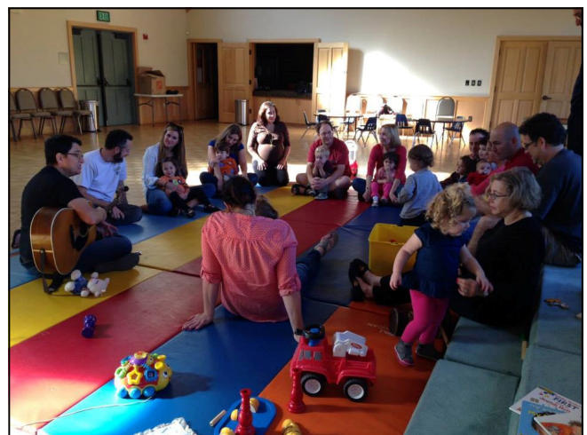
K'Tan Tan Sunday fun!