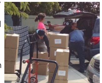
Moving books and furniture for High Holyday services.