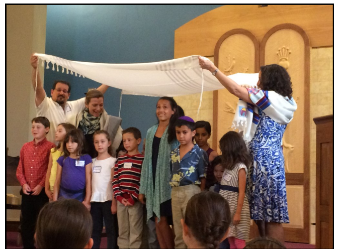
Consecration of our new students on Simchat Torah

I look forward to our continued success as we find meaningful paths into Temple lives, as we come forward for ourselves, and show up for each other.