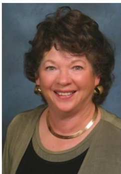
Broker Associate, DRE # 00608658

Helping my Real Estate clients connect to the Jewish Community since 1977