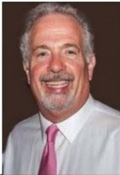
Sales Manager, DRE# 0-600020-2