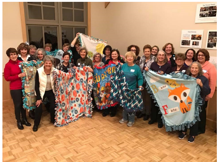
Sisterhood made 16 no-sew blankets for families at JFCS at their annual Chanukkah party in December.

Sign up at http://www.signupgenius.com/go/409od4daea2fa3fe3-beacbt