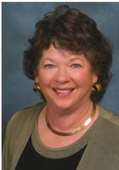
Broker Associate, DRE # 00608658

Helping my Real Estate clients connect to the Jewish Community since 1977