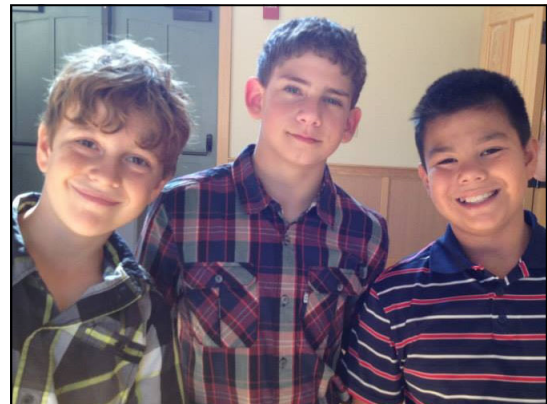
Smiles after the 5 th grade service.

Cleaning out your closet? Watch for December's Tikvah Talk details for CBT's collection of winter coats for One Warm Coat . Coats will be collected in the December - January timeframe.....more details to follow next month.