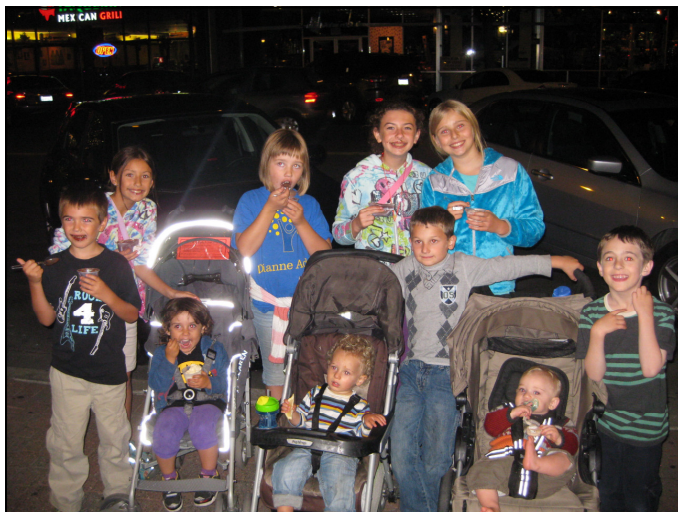
Participants of all ages enjoy our Restaurant Walk. Many end the evening at San Francisco Creamery.

Please patronize them and say thank you!