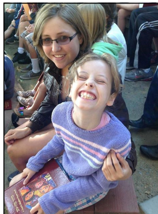
Lots of energy at Morning T'filah.