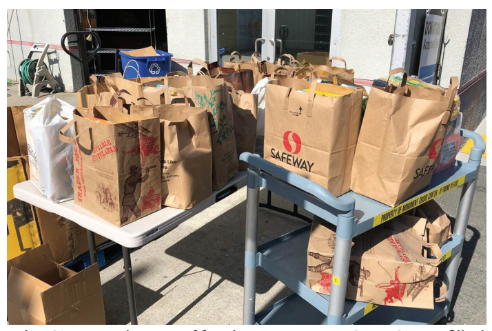
The CBT contribution of food at Monument Crisis Center filled an SUV! Thank you to the generosity of the Congregation B'nai Tikvah community!